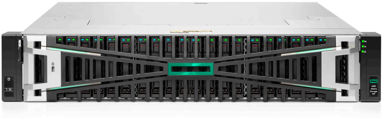
HPE GreenLake for Block Storage (2-Node all NVMe Storage Base)

HPE GreenLake for Block Storage brings mission-critical storage to the mid-range – delivering enterprise-class resiliency, performance, and scalability at an affordable price. Powered by the new HPE Alletra Storage MP hardware platform, HPE GreenLake for Block Storage is the industry's first disaggregated, scale-out block storage with 100% availability guaranteed. Get an intuitive, AI-driven cloud experience on-prem that simplifies management and shifts operations from infrastructure-centric to app-centric. Empower line of business with intelligent, self-service provisioning while managing and protecting workloads across your hybrid cloud from a single cloud console. Scale performance and capacity independently — and without disruption — with disaggregated storage. Meet every SLA with mission-critical storage that delivers an unrivalled 100% data availability guarantee. Accelerate your most demanding apps with consistently fast performance and ultra-low latency — even at scale.